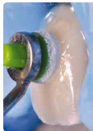
Cementation with Variolink® Esthetic Dr S. Kouji, France

The self-adhesive, self-curing resin cement SpeedCEM® Plus is particularly suitable for the cementation of zirconium oxide restorations.