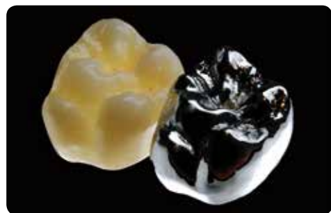
IPS e.max® Press crown compared to a full cast crown W. Weisser, Germany