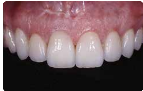
Complete dentures with IPS e.max Press Prof. Dr D. Edelhoff / O. Brix, Germany

In collaboration with your laboratory, select a treatment option that is suitable for the particular patient: a cost-effective, fully contoured restoration as an economical and appealing alternative to a full cast crown. Or you can choose a more exclusive option fabricated by means of the cut-back and layering technique, which will meet the high esthetic requirements of discerning patients.