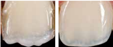
Application of Trans Opal Flow

The three effect materials show optimum surface affinity while ensuring stability. As a result of their smooth consistency, the materials can be conveniently contoured with a spatula or a brush.