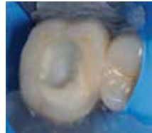
Application of Heliobond and masking with IPS Empress Direct Opaque