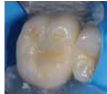
Characterization with IPS Empress Direct Color