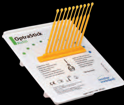
OptraStick Refill / 50 pieces