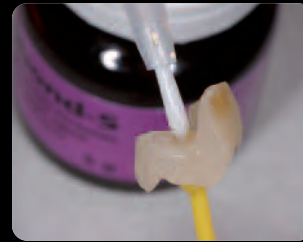
3. Silanization with Monobond-S