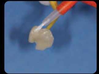
4. Application of the luting composite Multilink Automix