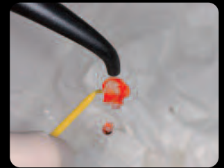
2. Removal of IPS Ceramic Etching Gel with water spray