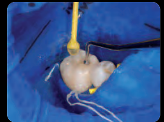
6. Removal of OptraStick using a hand instrument